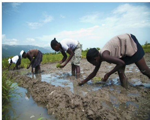
Des femmes emploient la méthode du Système d'Intensification de la Riziculture (SRI) pour augmenter la production.

As part of this initiative, the Appui à la Recherche et au Développement Agricole (AREA) project (2015-2020) will build the capacity of Haitian institutions and the private sector to improve the availability of and the access to agricultural innovations to improve production and market access. Through research and extension activities, AREA is building on and improving existing Haitian approaches to increase the availability of efficient production technologies in Haiti. Project activities will focus on the Feed the Future West region of Haiti encompassing the Port-au-Prince/Cul-de-Sac and St. Marc corridors. Agricultural projects in this region focus mainly on increasing the productivity of maize, rice, beans, plantains and vegetables.